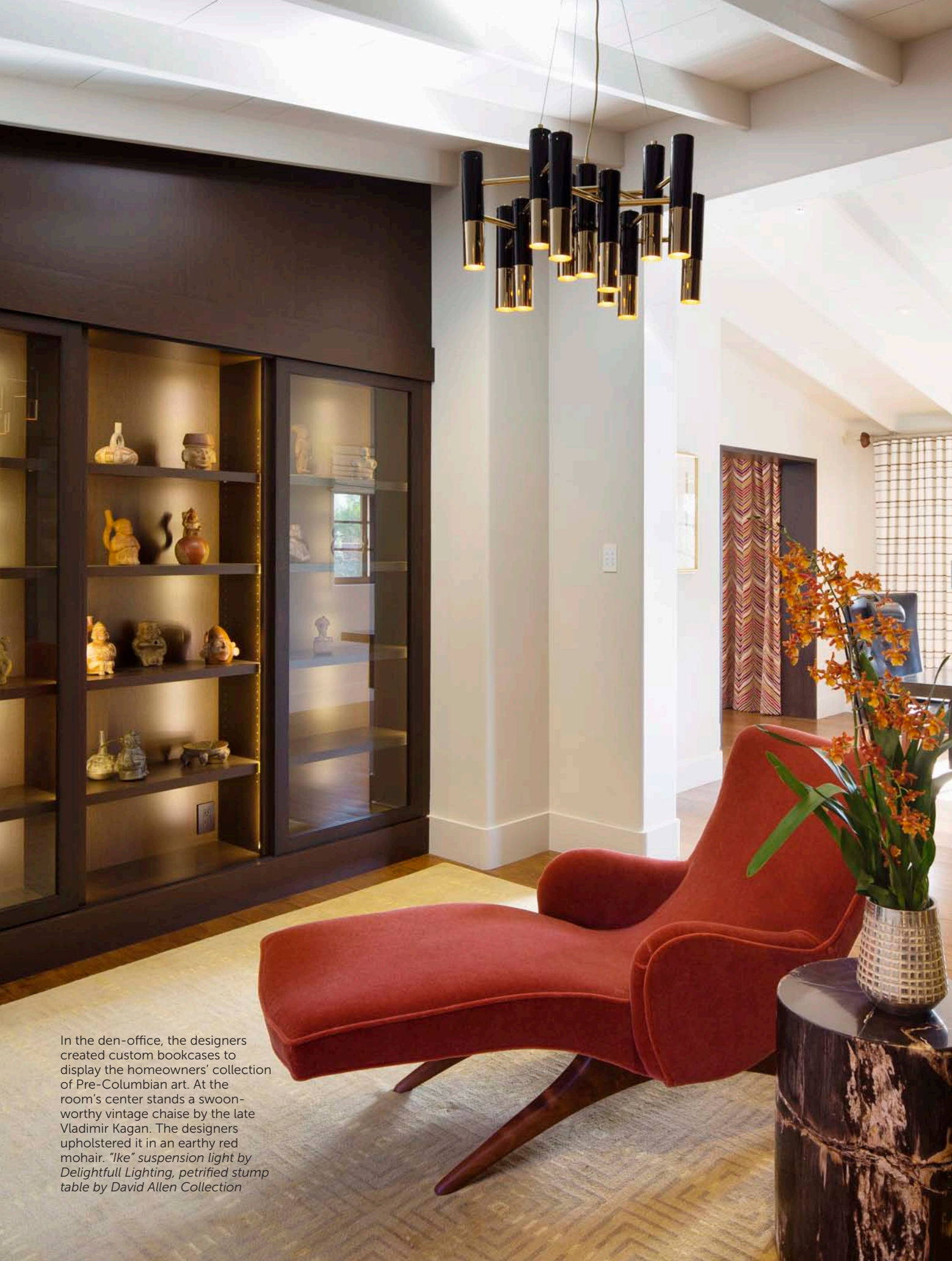
In the den-office, the designers created custom bookcases to display the homeowners' collection of Pre-Columbian art. At the room's center stands a swoon-worthy vintage chaise by the late Vladimir Kagan. The designers upholstered it in an earthy red mohair. "Ike" suspension light by Delightfull Lighting, petrified stump table by David Allen Collection