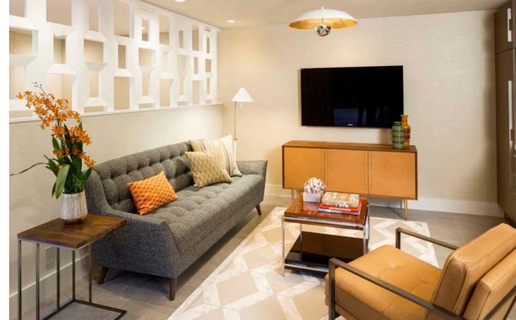
← In the detached guesthouse, Lopez and Niebling designed a custom portiere to separate the sleeping and living spaces. The living space includes a built-in fridge and other kitchen amenities hidden behind custom cabinetry.

architecture and refurbished midcentury furniture. The color palette is mostly neutral, thanks to the creamy gray walls and ceilings (Pale Oak by Benjamin Moore). "They wanted something very organic," Niebling says. "We lent pops of color with drapery and art."